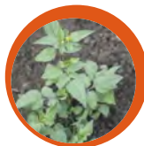
Bidens pilosa Common blackjack