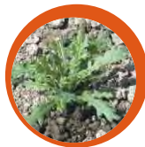
Conyza spp ( Erigeron bonariensis ) Hybrid pigweeds