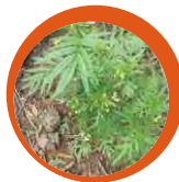
Tagetes minuta Tall khaki weed