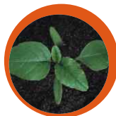
Amaranthus hybridus Hybrid pigweeds