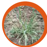
Avena fatua Common wild oats